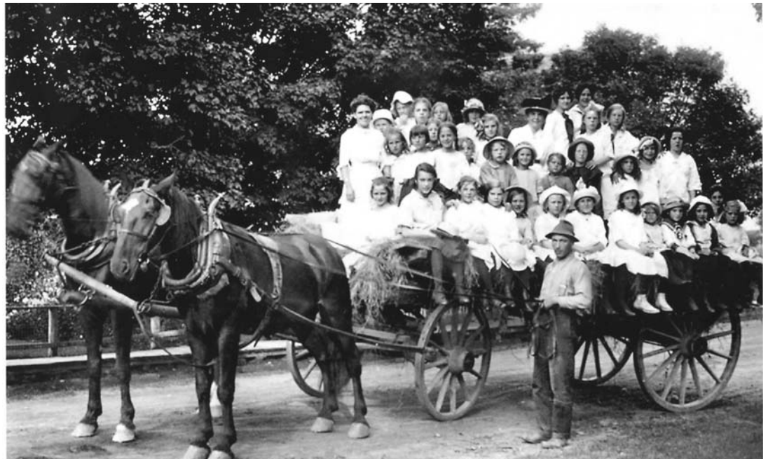
A Cool Haven for Toronto's Neediest Women & Girls, Jackson's Point, 1925